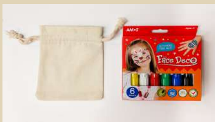
Body Paint Crayons

Kinesiology Tape is recommended If you have sensitive skin or feel skin allergy, body paint crayons can be used instead.